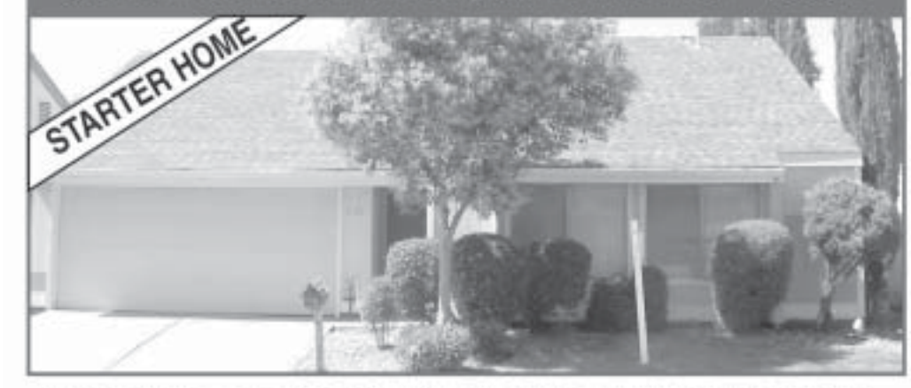
Take Advantage of our Buyer's Rebate Program. Earn Thousands of $$$ for your closing costs. Call for free consultation (925) 989-HOME.