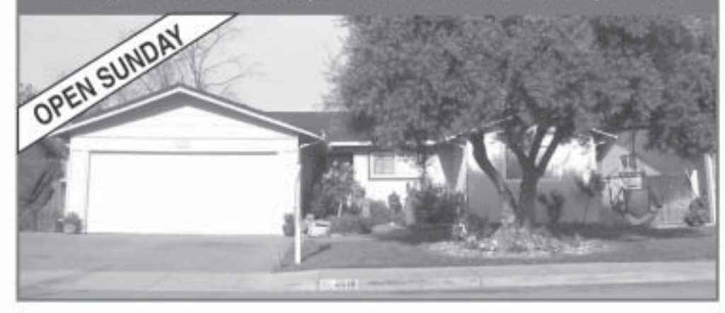
353 MEADOWOOD CIRCLE, SAN RAMON 3/2 $550K