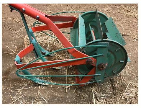
Above: The mystery object.

I'm assuming it is some sort of cultivator, but the action of the reel, bar and spikes suggest either a very specific purpose, or maybe just a novelty item that was sold by showing it fluffing through loam and nobody ever used it in real dirt. And note that I could not find a single identification mark on this. Do any of our Guild sleuths out there know anything more?