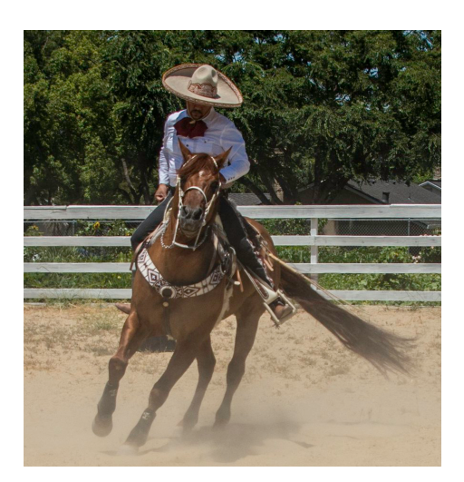
A member of the El Ranchero Charro Team performs.

On July 2, we celebrated the one year anniversary of opening the ranch to the public by hosting "Cowboy Day". The free celebration welcomed visitors