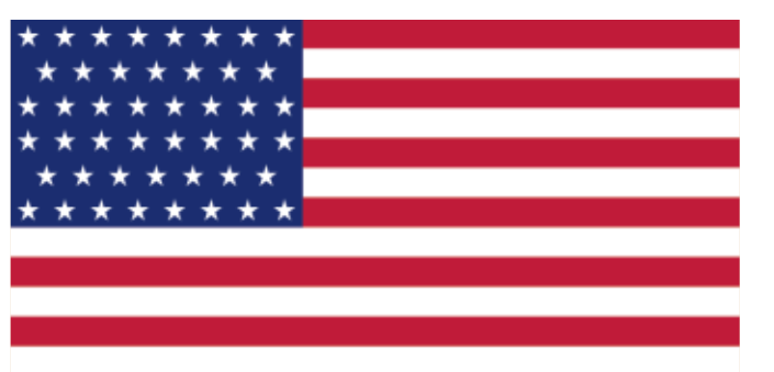
The U.S. flag had 46 stars in 1911. Oklahoma was no. 46.

In mid-May of 1911, Livermore's brand new Carnegie Library opened to the public. On Saturday, May 14, 2011, the Livermore Heritage Guild is joining forces with the Livermore Art Association (L.A.A.) to hold an art and history fair in celebration of this anniversary. The fair will be held at the Carnegie Park block (bordered by 3<sup>rd</sup>, 4<sup>th</sup>, J and K streets) from 10 a.m. to 4 p.m. The general public is invited, especially children. Admission is free.