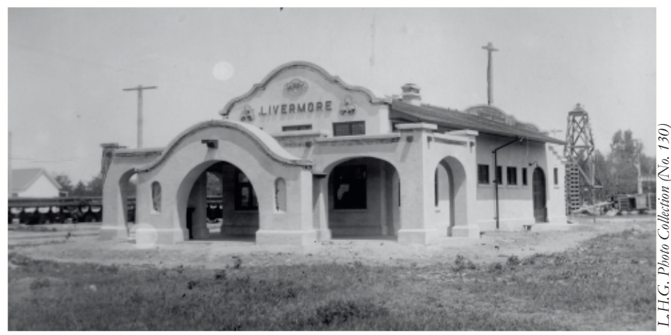
Livermore Western Pacific Passenger Depot circa 1909-10 (viewed from southwest). The city fire bell tower is visible to the right.

WP's 50<sup>rh</sup> anniversary was observed in 1953 with the "Old 94" steam locomotive from 1910 pulling the "Gold Coast" private car from Oakland to Sacramento. In 1960 "Old 94" pulled a special train from Niles to Oakland.