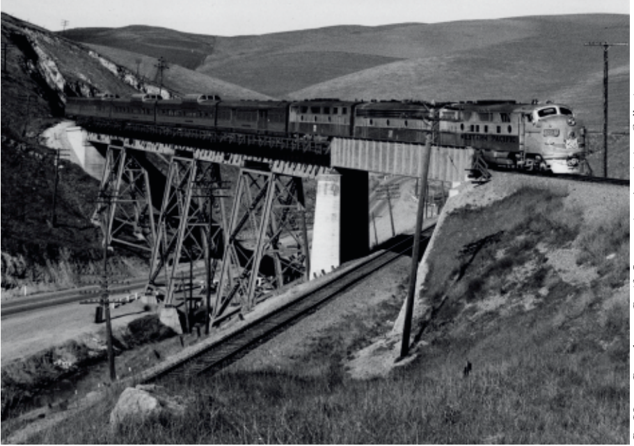
Above: Westbound WP #17 California Zephyr train with "Vista Dome" cars crosses trestle over Altamont Pass Road and SPRR in spring 1964. Below: Eastbound WP #2 "Royal Gorge" train on October 7, 1948 in Altamont Pass, possibly west of Carroll Road.

Today's Altamont Commuter Express (ACE) trains traverse the former WP