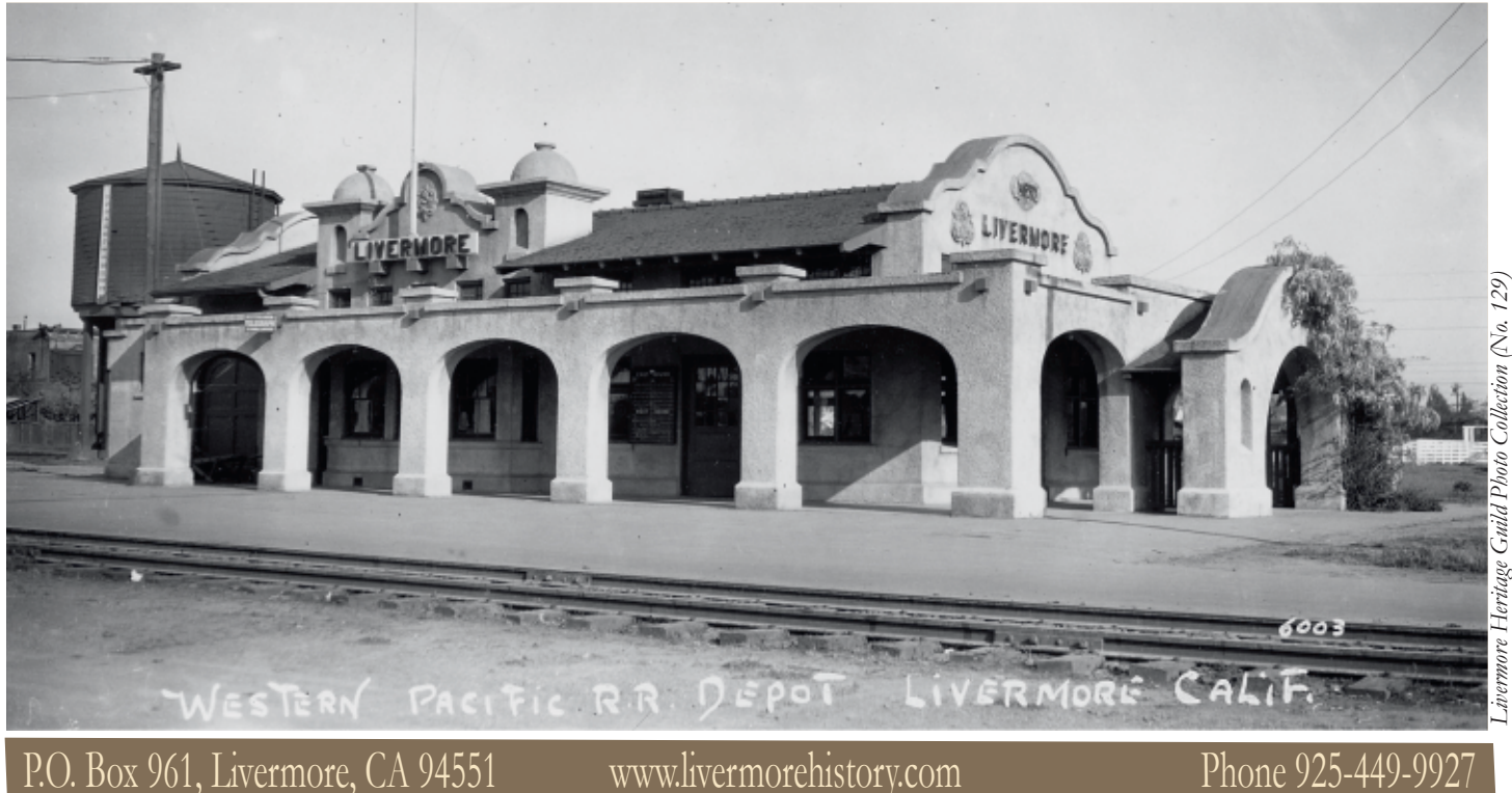
Saving Yesterday For Tomorrow