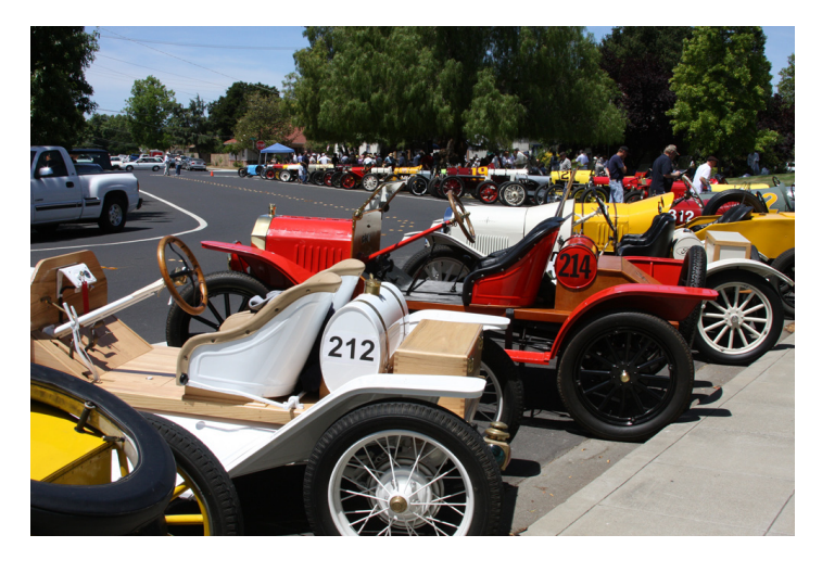
Images from the Guild's 2009 calendar. Antique Racecars at Duarte Garage, above, and Gordon House, left.