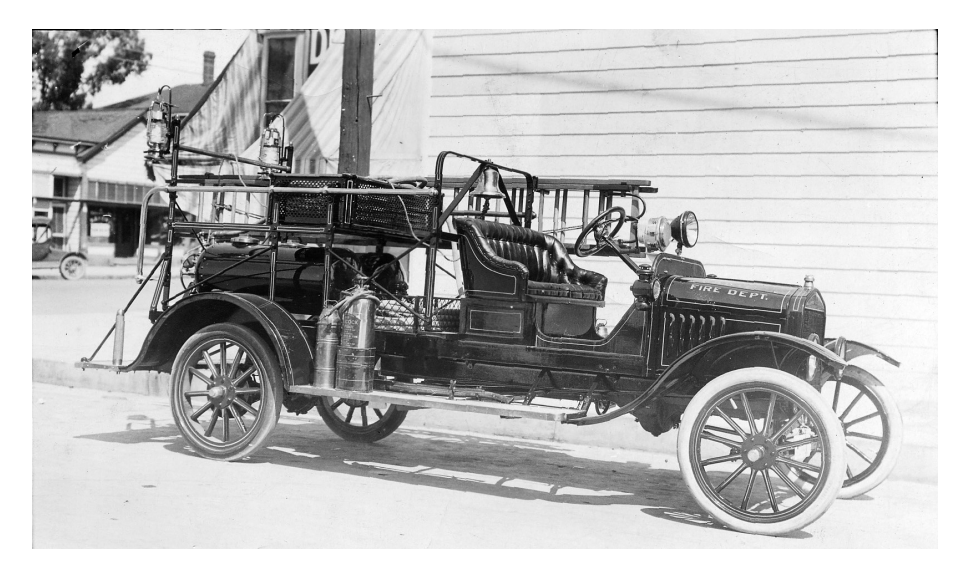
Coast Manufacturing, in 1920, bought a fully equipped automobile chemical fire engine.

"The machine is equipped with solid rubber rear tires, which it will enable it to go any place at any time without danger of loss of time from punctures. A new garage has been erected at the fuse works for the engine and a special device has been arranged to enable