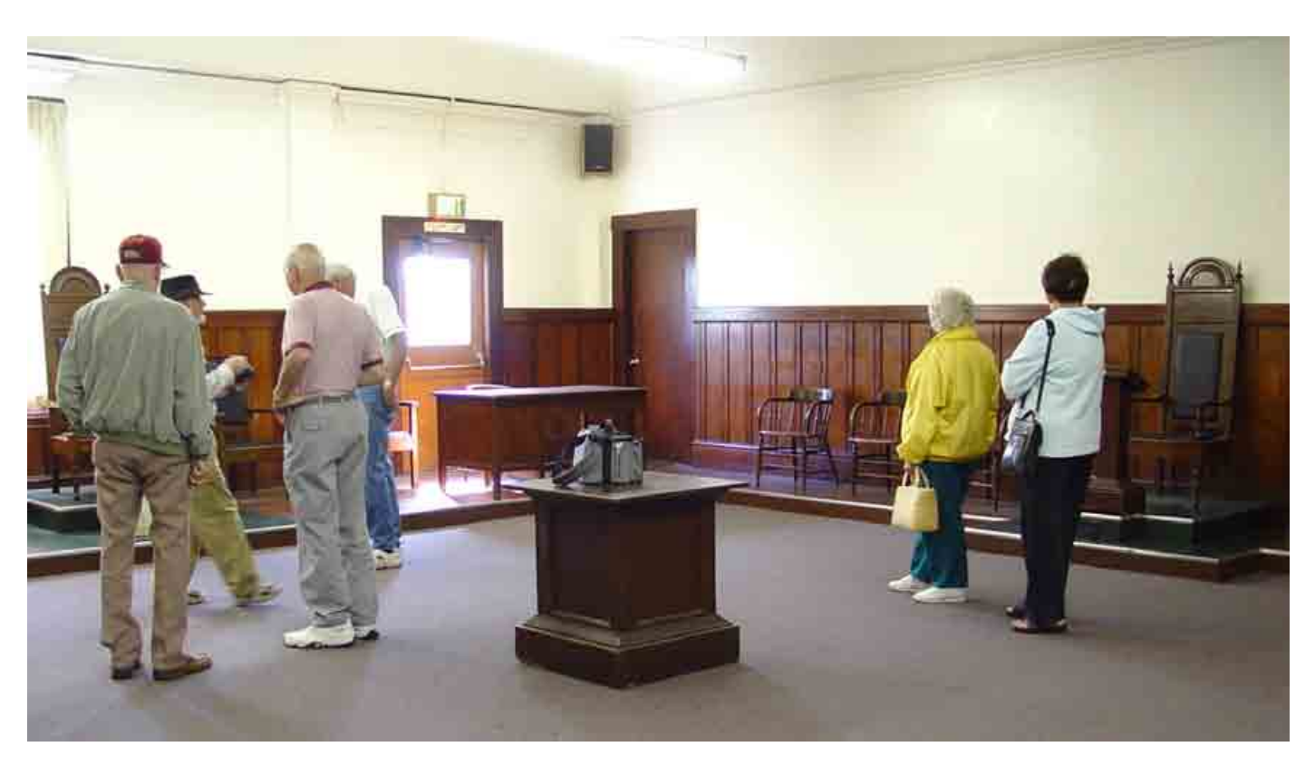
Above: Upstairs lodge room before furniture was removed