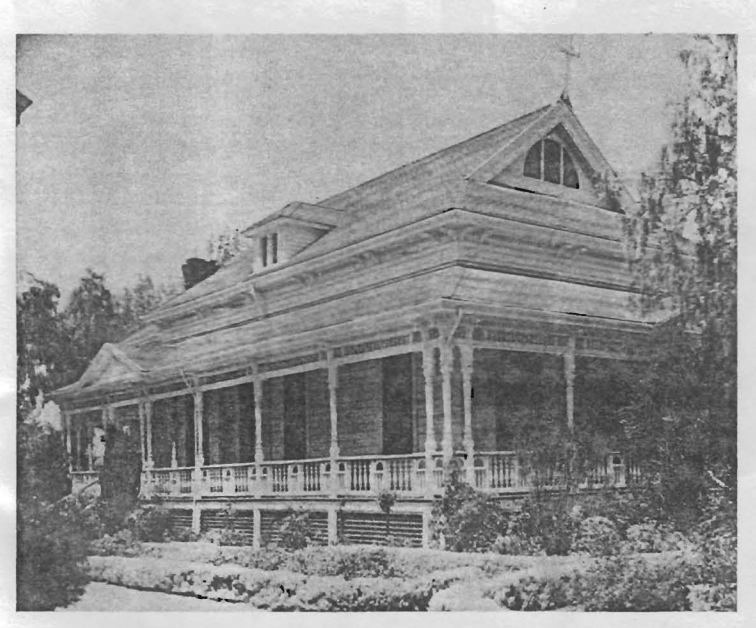
BIG HOUSE and GARDEN WHEN IT BELONGED TO THE REDEMPTIONIST FATHERS