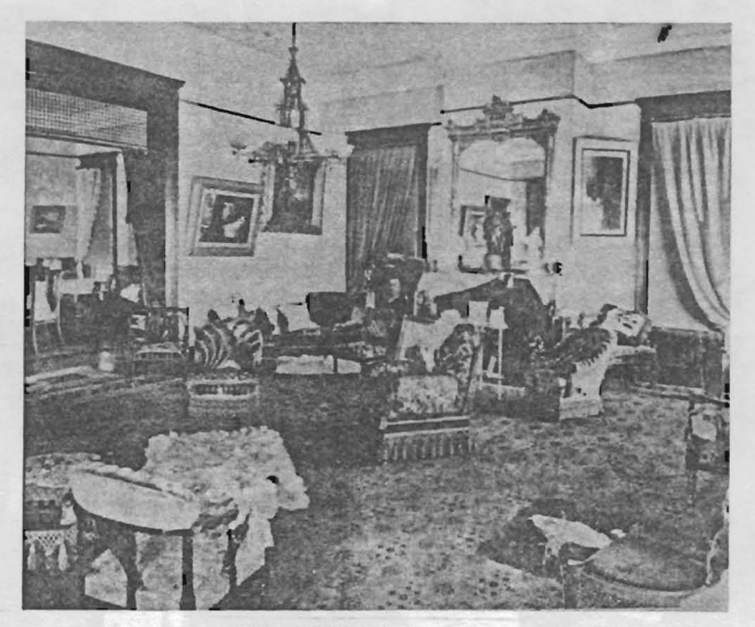
DRAWING ROOM, 1896